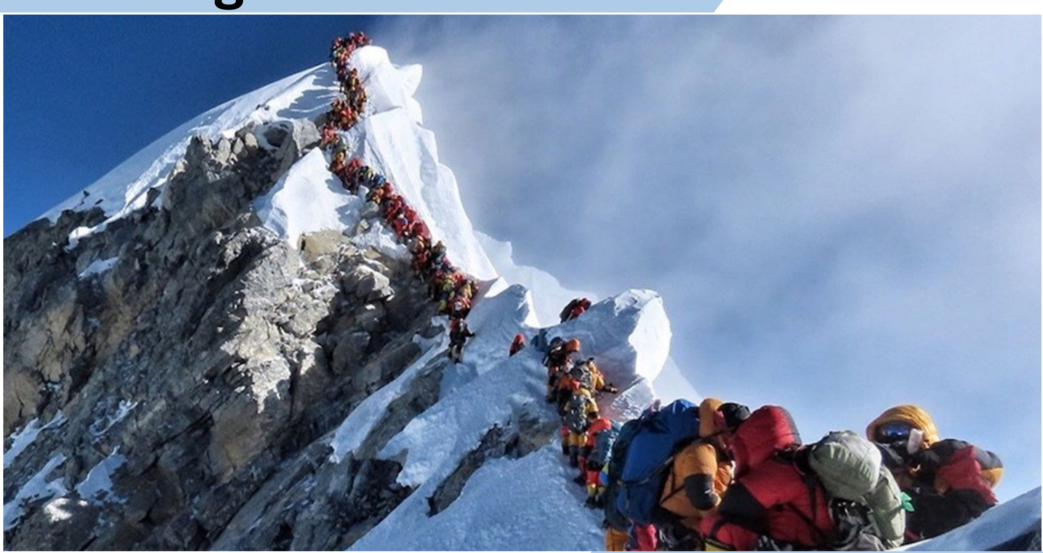
IPS 24-2.1 A View From ABOVE