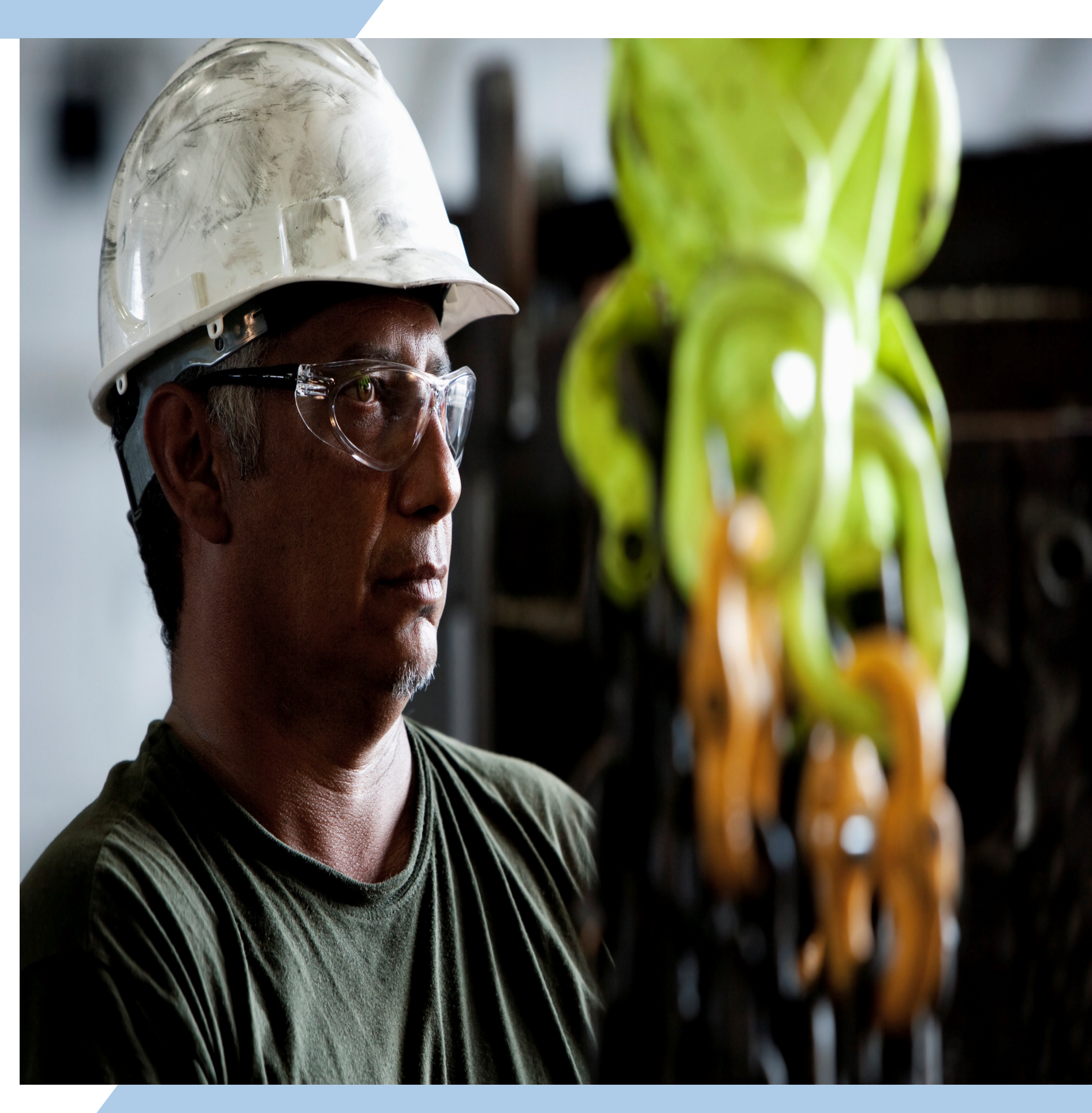
IPS 24-2.1 A View From ABOVE